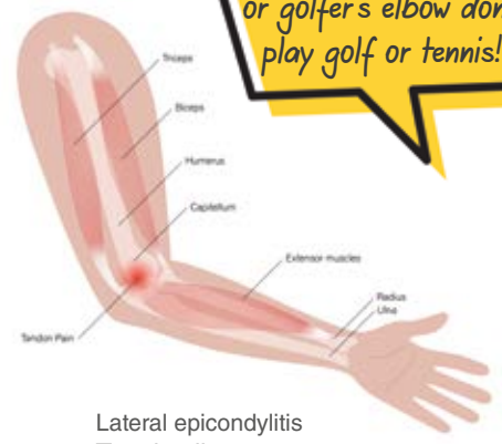
Lateral epicondylitis Tennis elbow